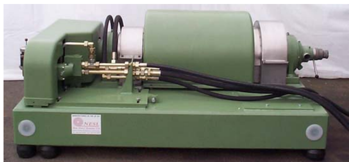
Flottweg Z42-3/441 with ROTODIFF

NES 800 series of Oil Recovery Systems use Flottweg 3 Phase Centrifuges with the unique adjustable weir system which allows the operator to continuously adjust the water/oil quality during operation without the need to shut down the centrifuge